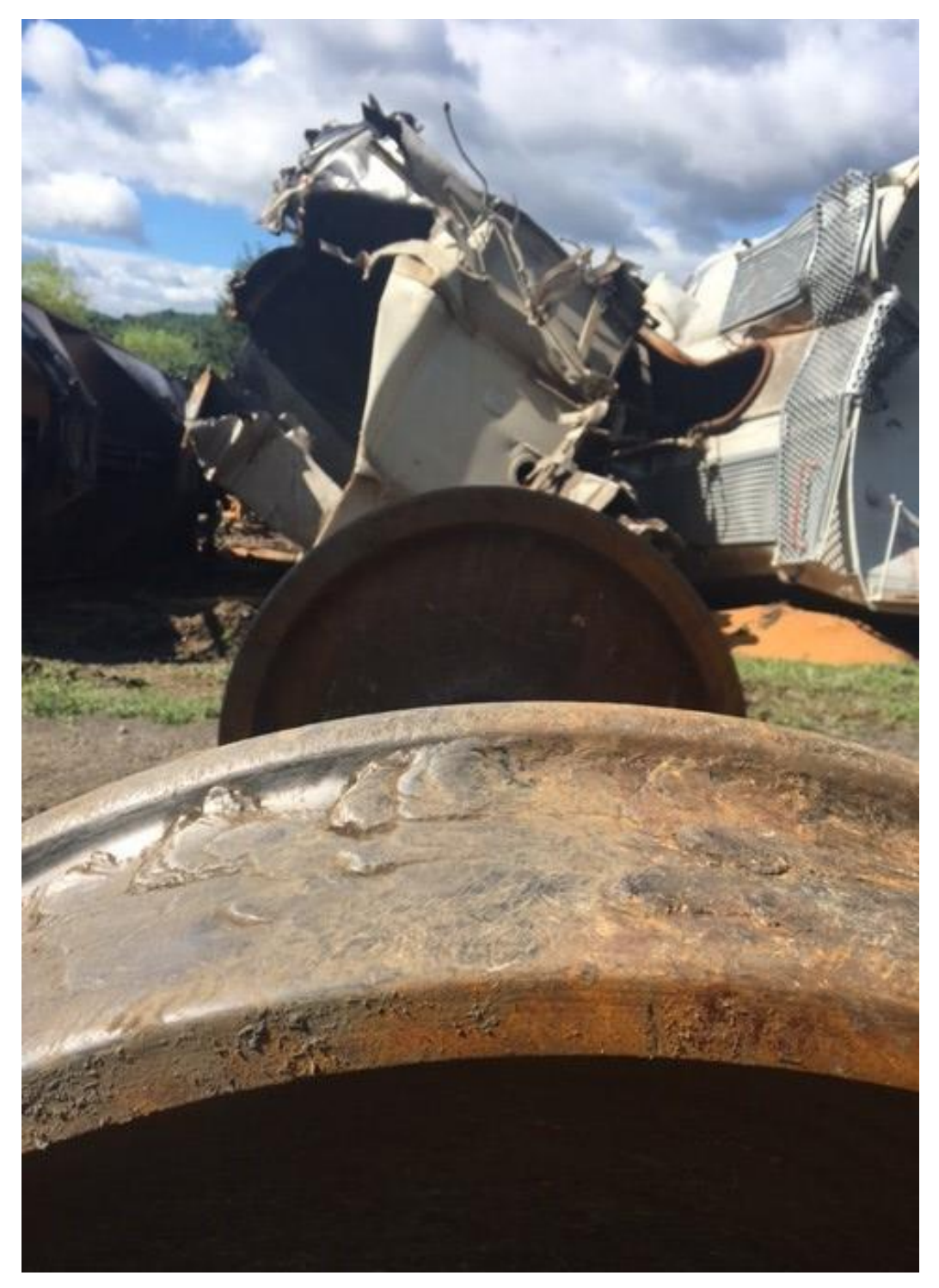
Figure 3. A close-up view of a wheel tread surface (from a wheel of the 35<sup>th</sup> cars' #3-wheel set). Heavy metal build-up can be seen on the tread surface and in the throat of the wheel flange.