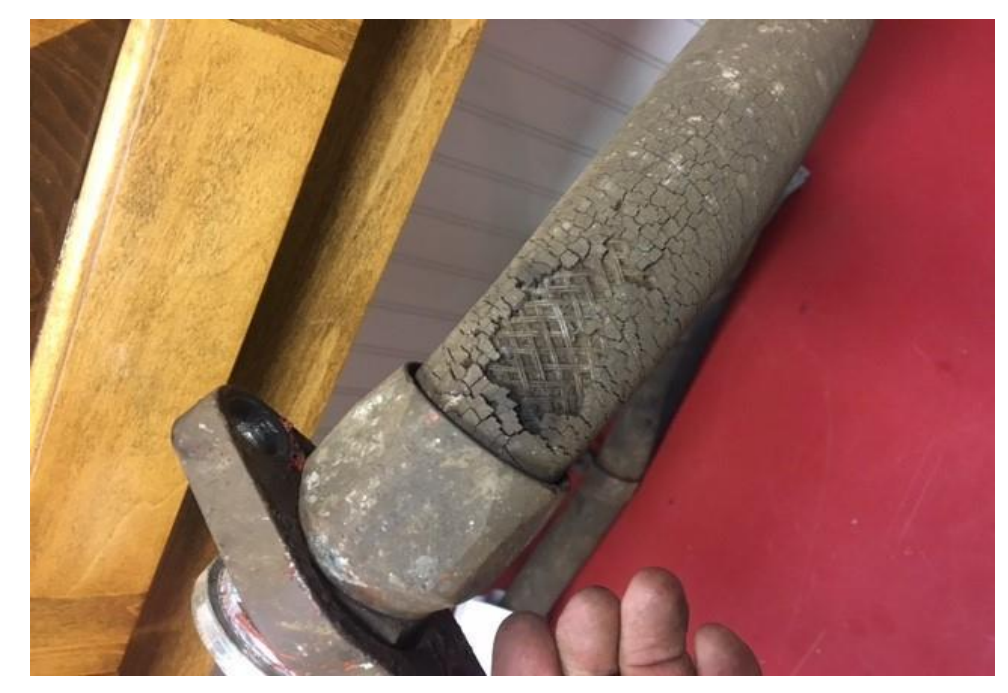
Figure 4. A close-up view of the intermediate air brake hose removed from car LW 62114 due to leakage. Some deterioration of the hose cover can be seen next to the hose assembly fitting.