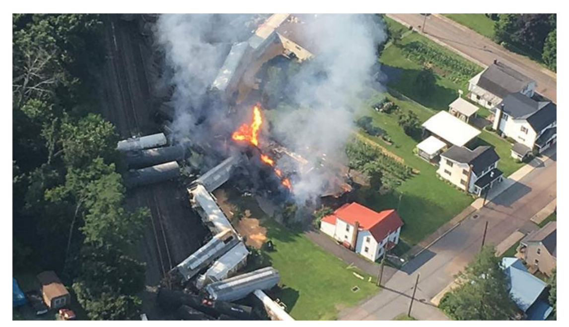
Figure 1. Aerial view of accident location. Several houses are seen within the photograph. Near the center are several derailed railcars and a fire with smoke rising from the site.